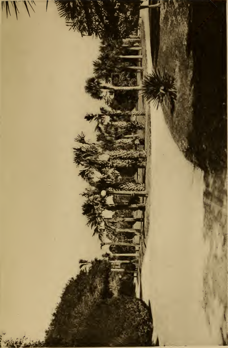
CLUB HOUSE LAWN